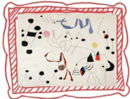
Woman dreaming of escape