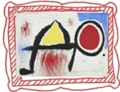
Figure in front of the sun