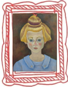
Portrait of a young girl