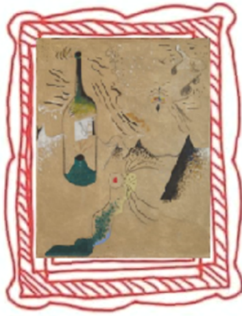
The bottle of wine