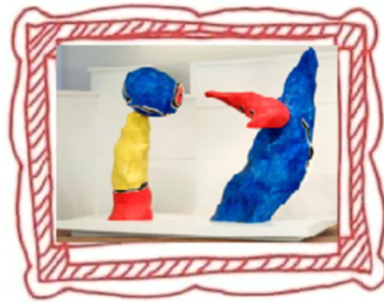
Pair of lovers playing with almond blossoms