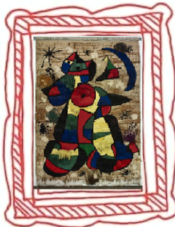
Tapestry of the Fundació