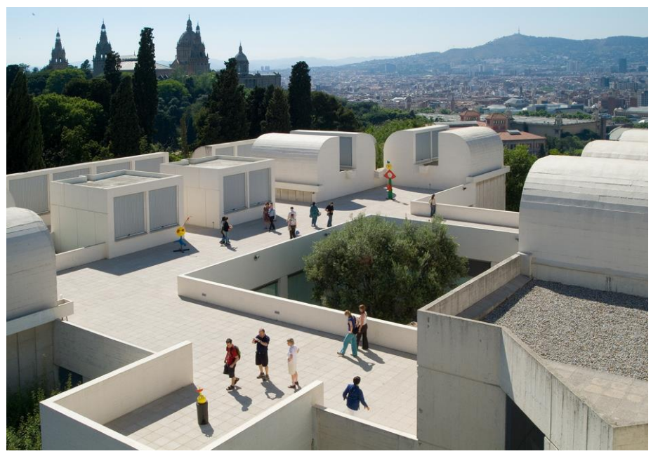
Aerial view of the Fundació Joan Miró, Barcelona.