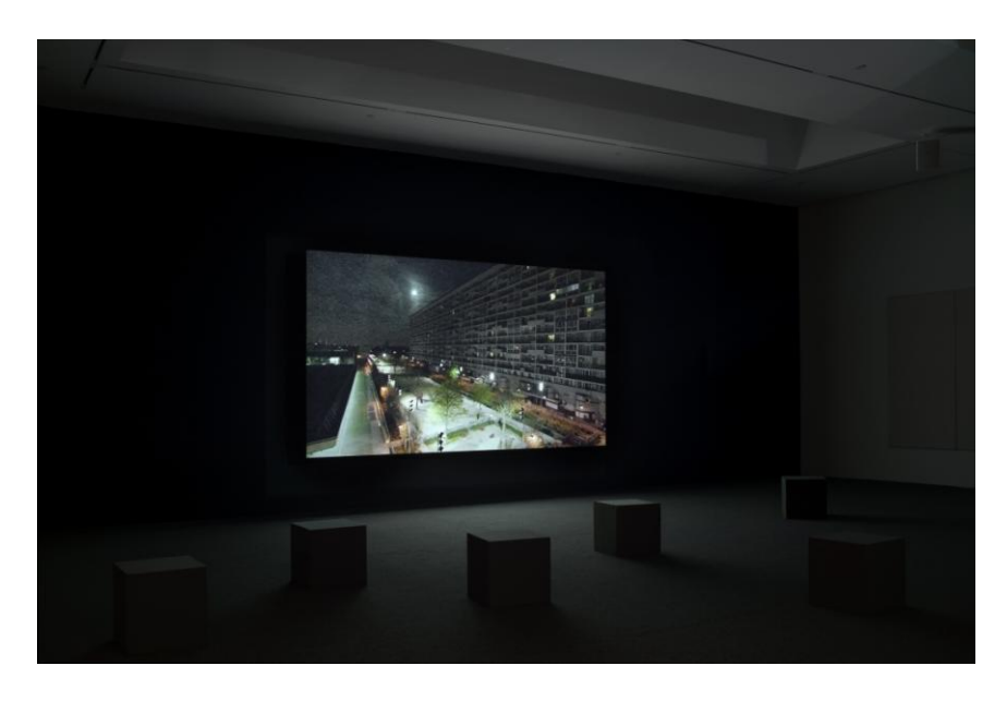
Stan Douglas, Video, High-definition video installation. 18:11 min (loop), six musical variations, 2007