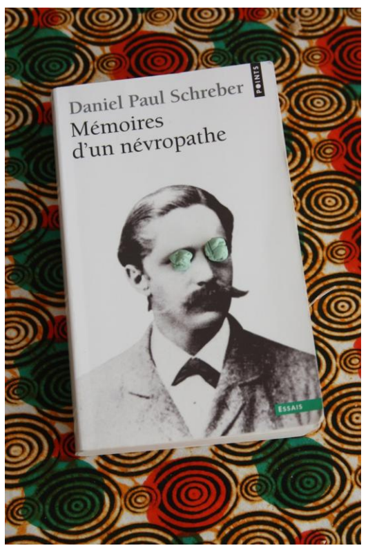
12 July – 1 September 2013 Opening: 11 July 2013, 19.30 h

Exhibition in the Perplexity cycle Curator: David Armengol