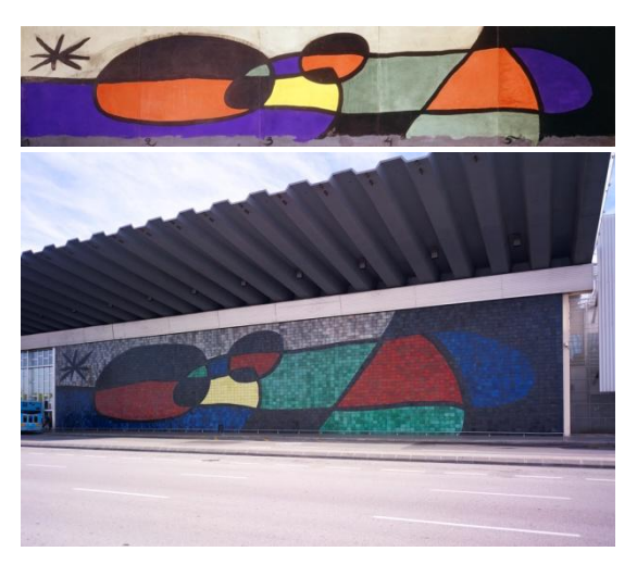
Joan Miró. Model for Airport Mural , Barcelona, 1970. Fundació Joan Miró, Barcelona

Joan Miró's first work for public space is the Airport Mural , which was commissioned by the Barcelona City Council in 1968 on the occasion of the exhibition Miró which was held in the Antic Hospital de la Santa Creu with a view to opening the city to the outside world. Miró created the mural of ten metres high and fifty metres long with a view to its being seen from a distance, giving prominence to colour so that the composition consists of large areas of colour in interplay with the contrast of black outlines. Working with Josep Llorens Artigas, he conceived the work as a way of addressing the world and thinking about the mural's permanence in the future.