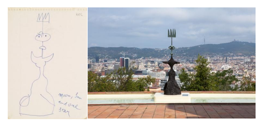
Joan Miró. Preliminary sketch for Moon, Sun and One Star , 1968. Fundació Joan Miró, Barcelona Model for "Monument Offered to the City of Barcelona" in the North Patio of the Fundació Joan Miró

Joan Miró and Artigas designed a monumental sculpture that was initially commissioned for the city of Chicago. When the project was shelved due to lack of finance, Miró offered it to Barcelona for the Parc de Cervantes, as a gift for people entering the city by road. In the end, the large-scale sculpture did not materialise in Barcelona, and the project was later taken up again by the Chicago City Council. The model for a "Monument offered to the city of Barcelona", also known as Miss Chicago , testifies to the fact that the work has also remained in the city, where it has been installed in the North Patio of the Foundation to become a symbol of the institution.