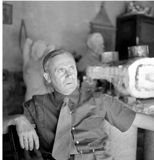
Joaquim Gomis. Portrait of Joan Miró, 1944.

Images available at http://bit.ly/UniversMiró